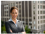
Training and Technical Assistance

North American Management's Housing and Community Revitalization Group focuses on improving the effectiveness of Federal, State and local public and assisted housing programs through expert research, technical assistance, management tools and strategic planning. Our solutions and products allow clients to improve and enhance the quality of life for our nation's communities in a cost-effective manner. Our team of experts empowers housing organizations to become high performance organizations. Our services and work products include, but are not limited to the following: