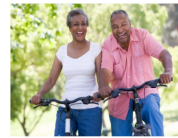
Administrative and Management Support