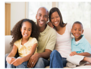
Low Income Public Housing