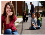
Low Income Public Housing